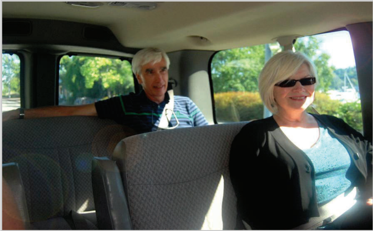
Vanpool with co-workers!

http://pinalcountyaz.gov/Departments/AirQuality/Pages/TravelReduction.aspx