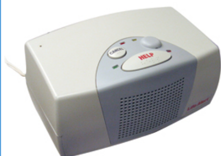
Home Alone System